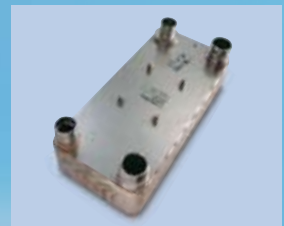
Stainless steel plate exchanger