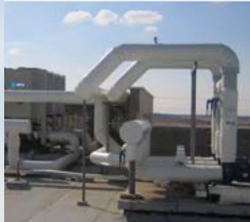
Process cooling application

In many cases the chiller forms part of a complex hydraulic network. MTA offers expert consultancy born from extensive field experience in countless applications, allowing Users to obtain the most from their chilled water network.