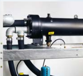
Shell & tube condenser

Water-cooled models offer elevated energy efficiency (EER) levels, and are well suited to hot ambients, or those where indoor installation is required. Noise levels are also reduced notably. (separate document available)