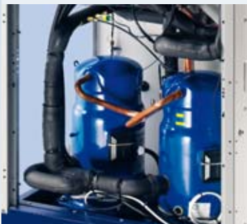
Easy frontal access

TAE evo always operates in all conditions, thanks to an internal trace water by-pass, numerous safety devices, generous water temperature limits, a 46°C ambient temperature limit, antifreeze protection and an internal water level sensor. The advanced microprocessor ensures fail-safe operation at all times.