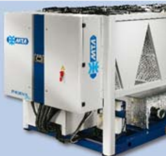
Phoenix Plus chiller

MTA offers industrial air and water-cooled chillers up to 1500kW, with multiscroll, piston, screw or centrifugal compressors. Freecooling units, ideal for industrial applications, are also available. (separate documents available)