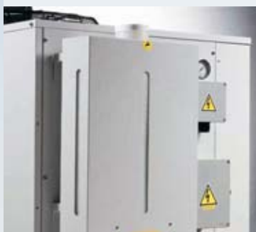
Atmospheric pressure fill kit

This kit (from 015) is simply installed onto the back of the chiller itself, and features a generous tank (with an easy to read water level indication) encased within a tough galvanized steel cabinet. A tap offers easy chiller water tank filling. The fill kit is standard on models M03-10.