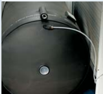
Large buffer tank