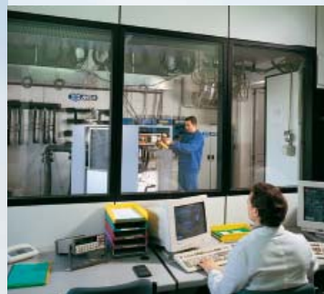
Extensively lab tested