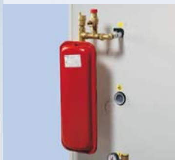
Pressurised fill kit

This kit, available from model 015, is used in pressurised water circuit applications (up to 6barg). The kit features all components required for safe and easy operation, including a pressure reducer, water inlet valve, pressure gauge, automatic relief valve, safety valve and expansion tank.