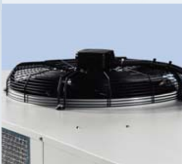
Robust fan section

The most popular solution, with an air-cooled condenser allowing quick and easy installation and high versatility in a multitude of applications. As per the rest of the range, the internal tank and pump offer a fully packaged solution.